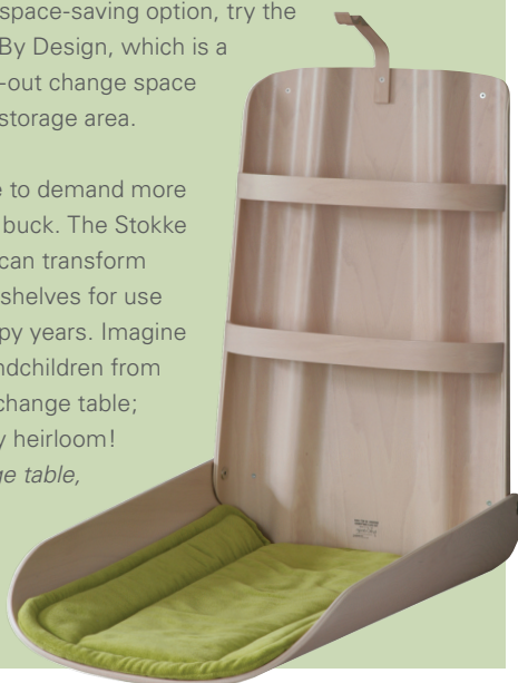
Image Nathi change table, $799 (matches the Leander cot). See danishbydesign.com.au .

It's understandable to demand more bang for your baby buck. The Stokke Care change table can transform into a desk or bookshelves for use far beyond the nappy years. Imagine writing to your grandchildren from their mother's old change table; that's quite a family heirloom!