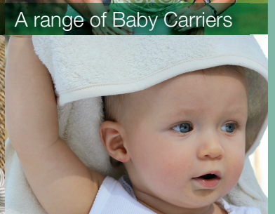
Bedding & Sleepwear