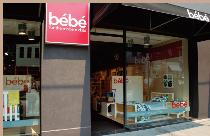
COMPILED BY SARAH FRIGGERI. ALL PRICES ARE APPROXIMATE

Bébé can be found at 36-38 Toorak Road, South Yarra, in Melbourne or online at bebeonline.com.au .